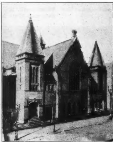
CONCORD BAPTIST CHURCH